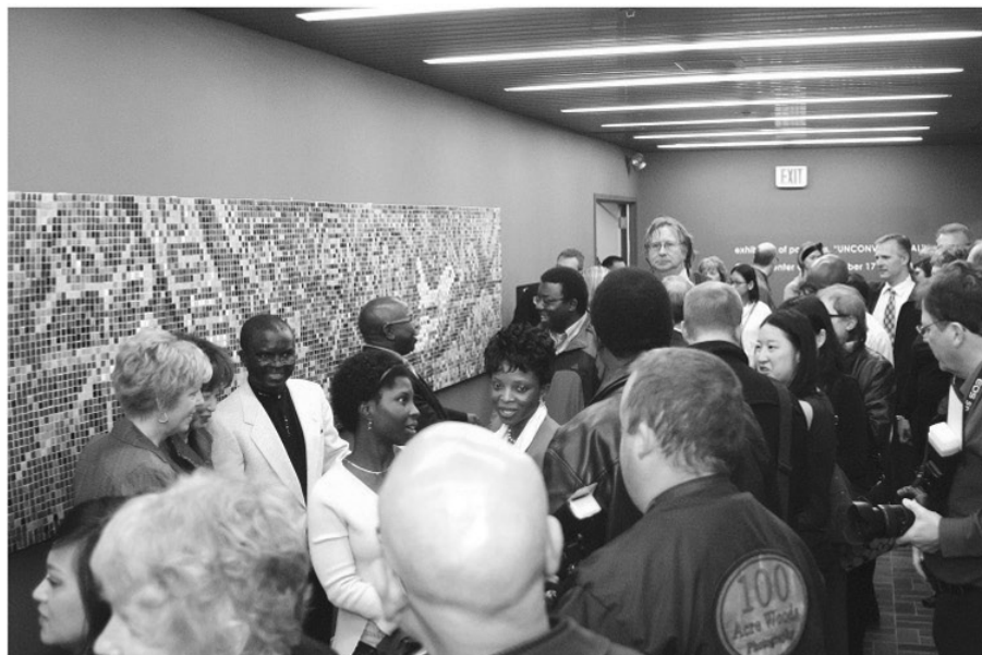
Unveiling reception of "Peace and Purpose" at CNIB.

constant renewable resource. An investment in the Arts will create more jobs. Millions of people attend arts events every year in Manitoba. Arts has made a significant difference in our