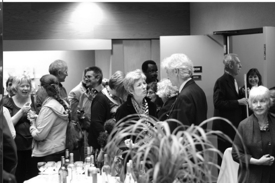
Art encourages each one to share in the imagination of others.

created in the process. The theatre as an arm of arts builds harmony with and among people, just like visual arts, music, dance, and others do, through shared stories. Therefore, use