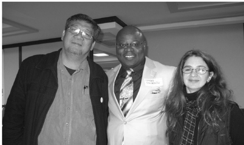
Mentoring to contribute to the greatness of our youth for a better tomorrow.

your artistic capacity to bring harmony to the world. Strive to understand differences, and respect them, just as they respect you.