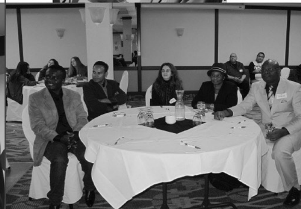
Participants listening to the keynote speaker.

is unquantifiable. It makes our world interestingly amazing. A practical example is obvious if we take a closer look at Winnipeg Jets. If you take arts from a sporting team like Winnipeg Jets, you have nothing left. Look at the